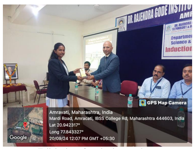
Felicitation of meritorious students