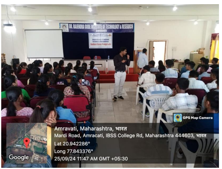
Guest Lecture on Developing a Positive Mindset