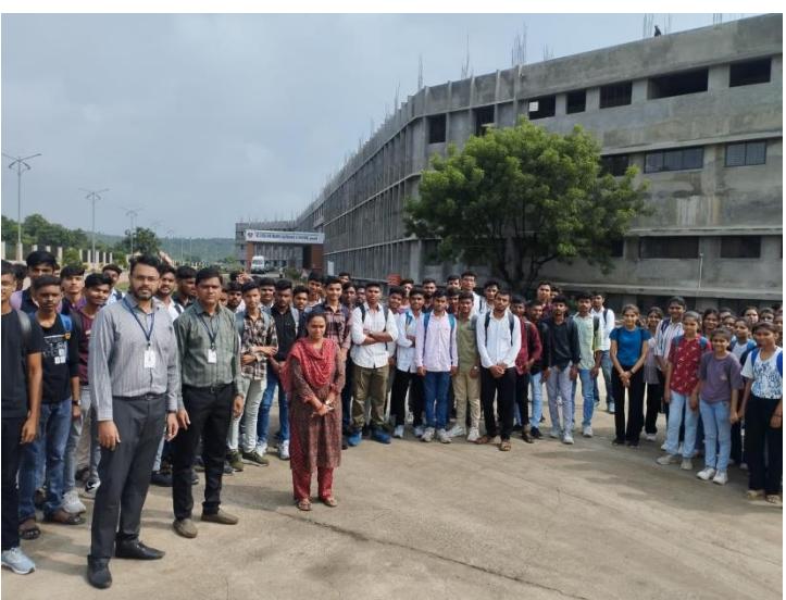
.Visit to Dr. Rajendra Gode Medical College and Hospital