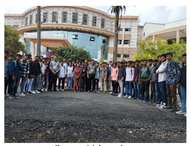
Campus visit by students

Details: The tour was organized on 24/09/24 to familiarize first year students with the facilities, resources, and culture of the campus. The students visited to all the colleges and hospital. They were given information about various academic, recreational, residential and medical facilities and services available for them in the campus. The campus tour successfully introduced newly admitted students to the college's environment, helping them feel welcomed and prepared for the academic year ahead.