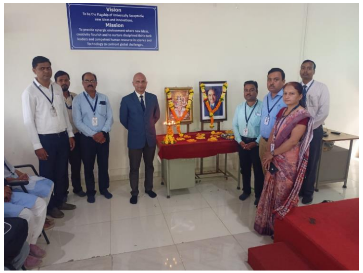
Lamp Lightning Ceremony