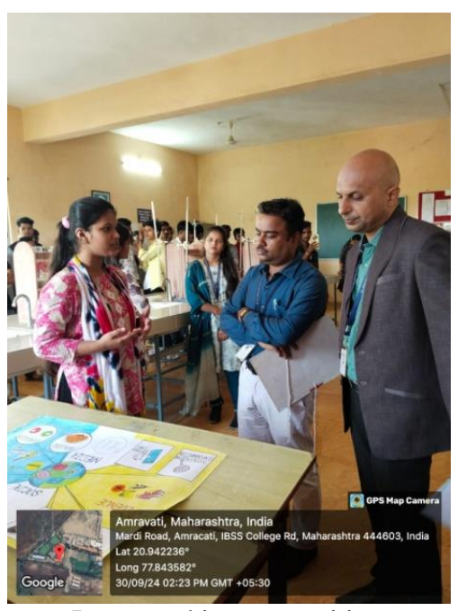
Poster making competition