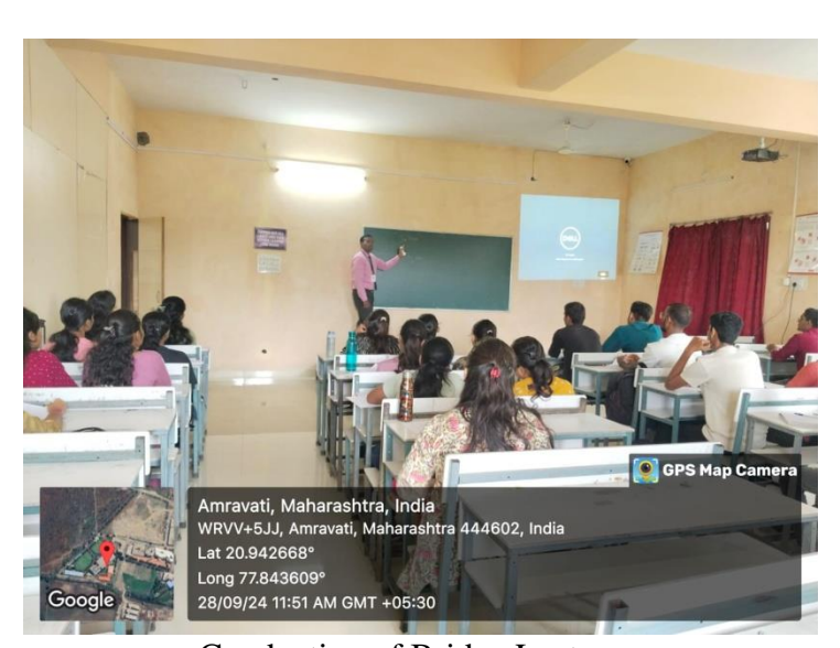
Conduction of Bridge Lectures

Details: The poster making competition allowed students to display their artistic skills. The theme was related to latest engineering issues and students created posters that highlighted various engineering innovations and their potential impact. The competition encouraged creativity and teamwork, as some students worked in pairs or small groups.