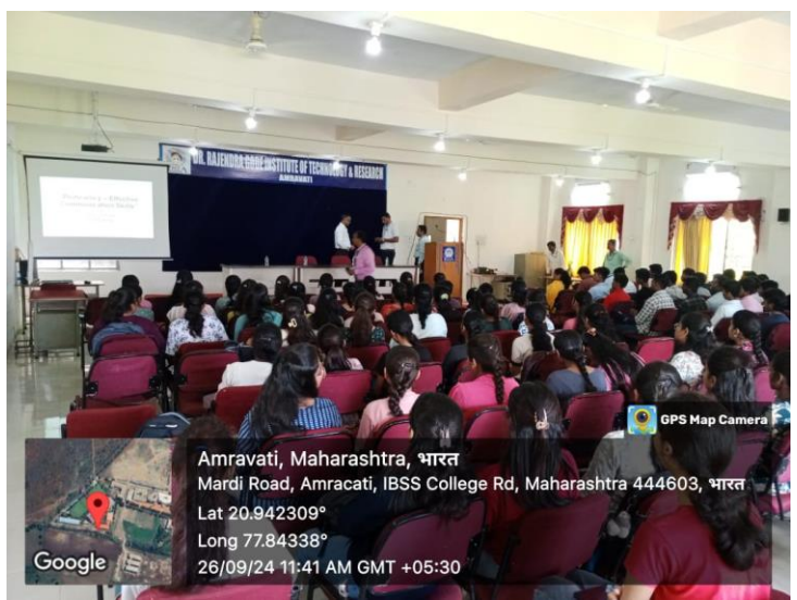
Expert Lecture on Effective Communication Skills