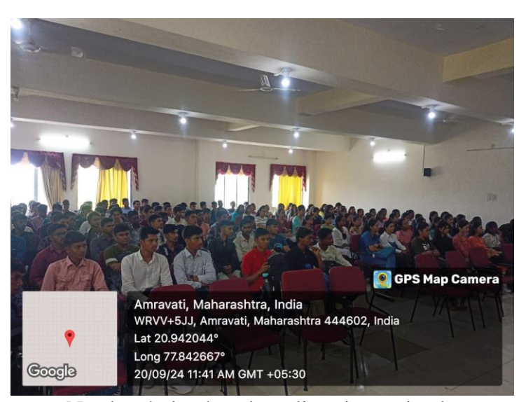
Newly admitted students listening patiently